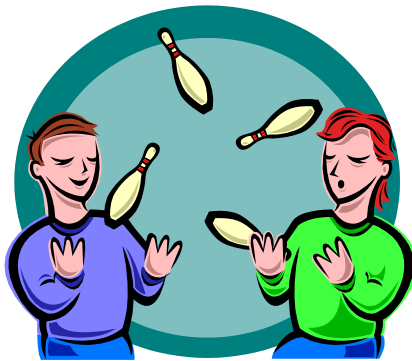
Map to Barrymore Theater (Location of January Juggling Show)